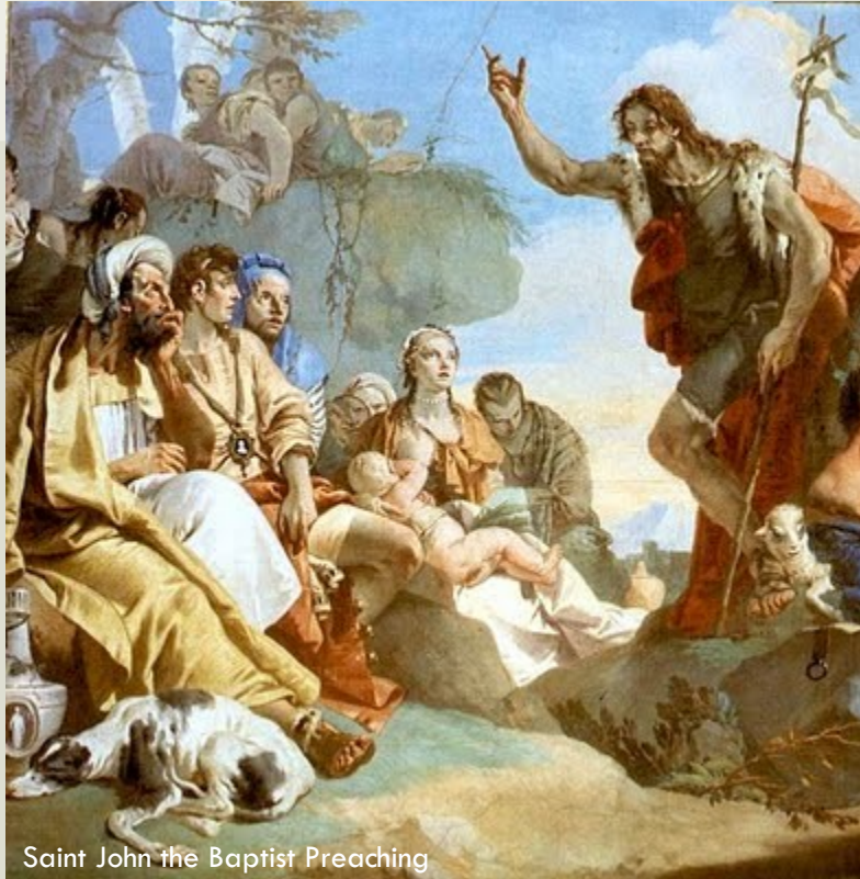
Saint John the Baptist Preaching