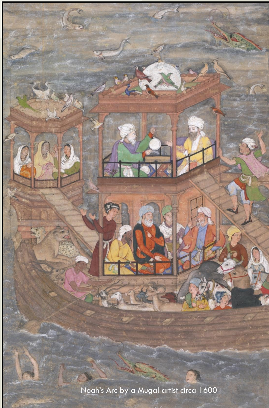
Noah's Arc by a Mugal artist circa 1600