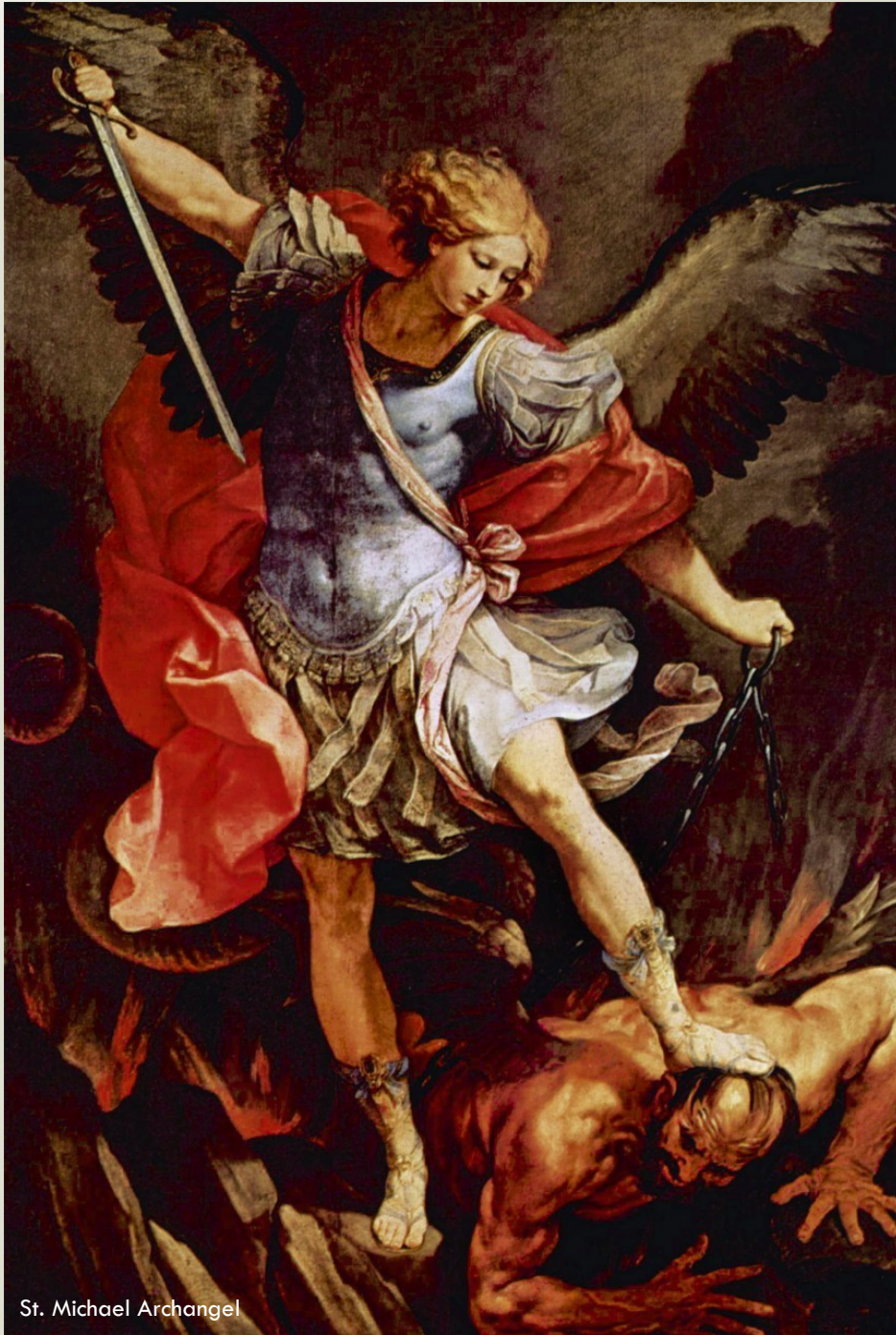
St. Michael Archangel