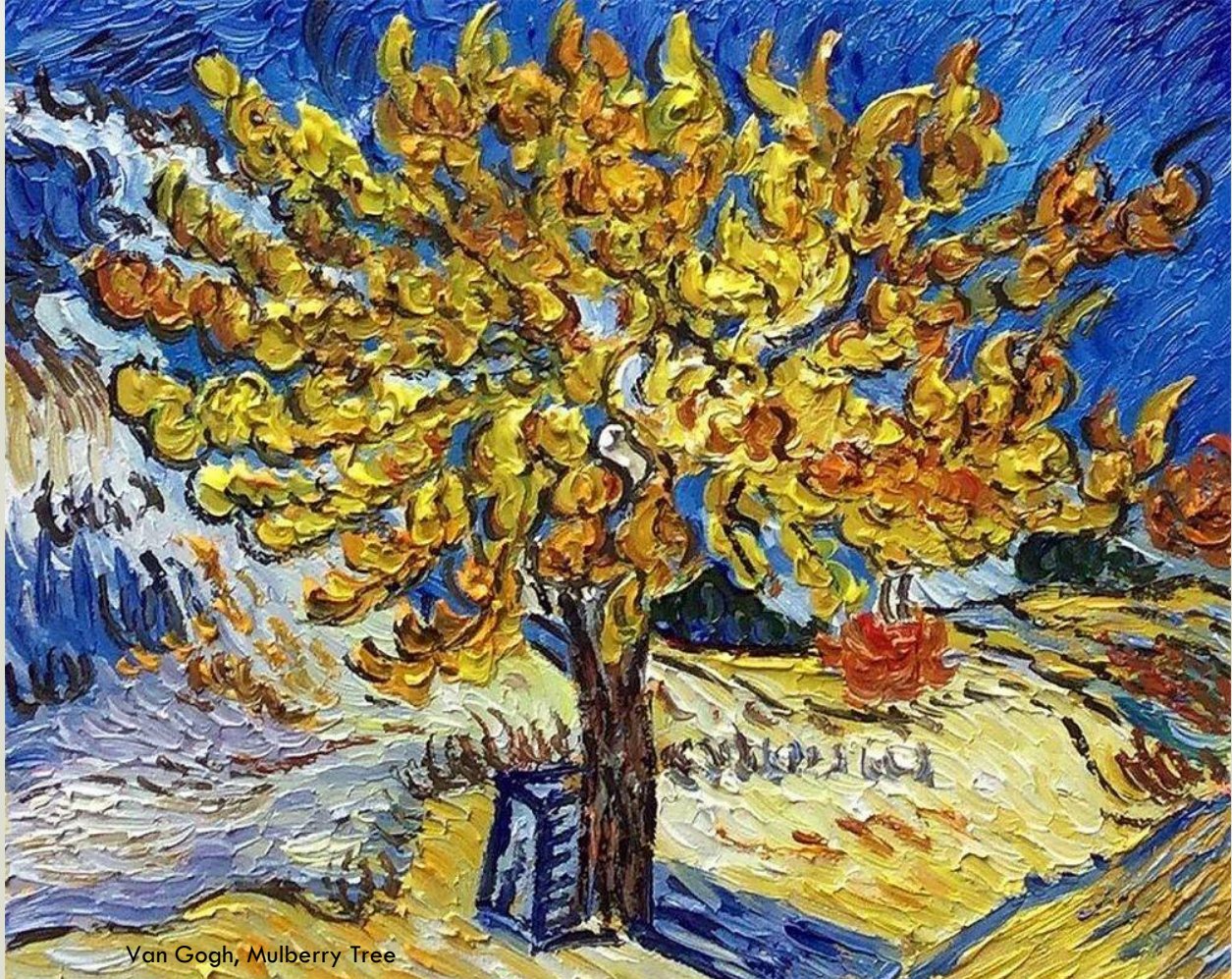
Van Gogh, Mulberry Tree