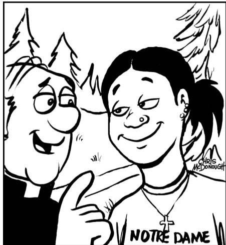
"In college, remember, just as important as your grade point average is your grace point average."