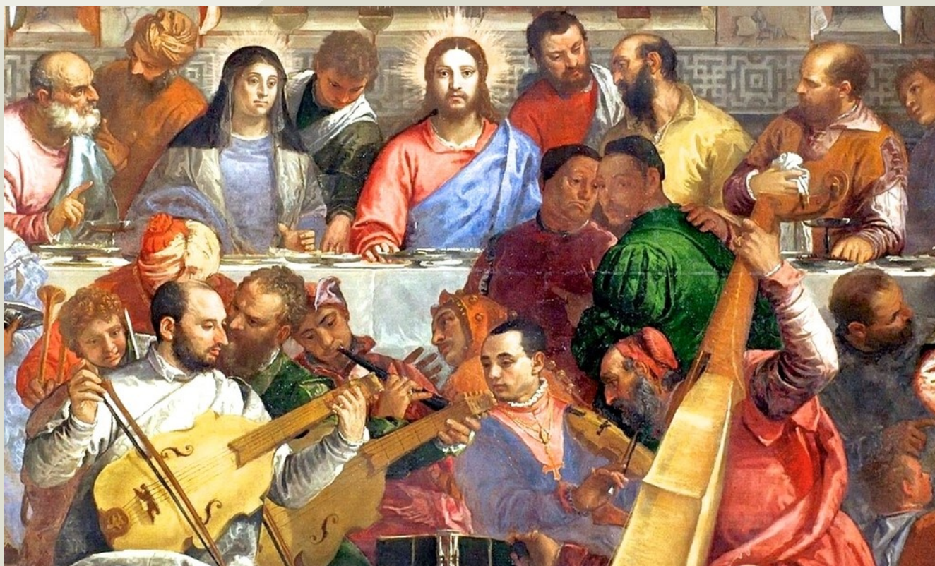
Veronese, The Wedding Feast at Cana (1563)