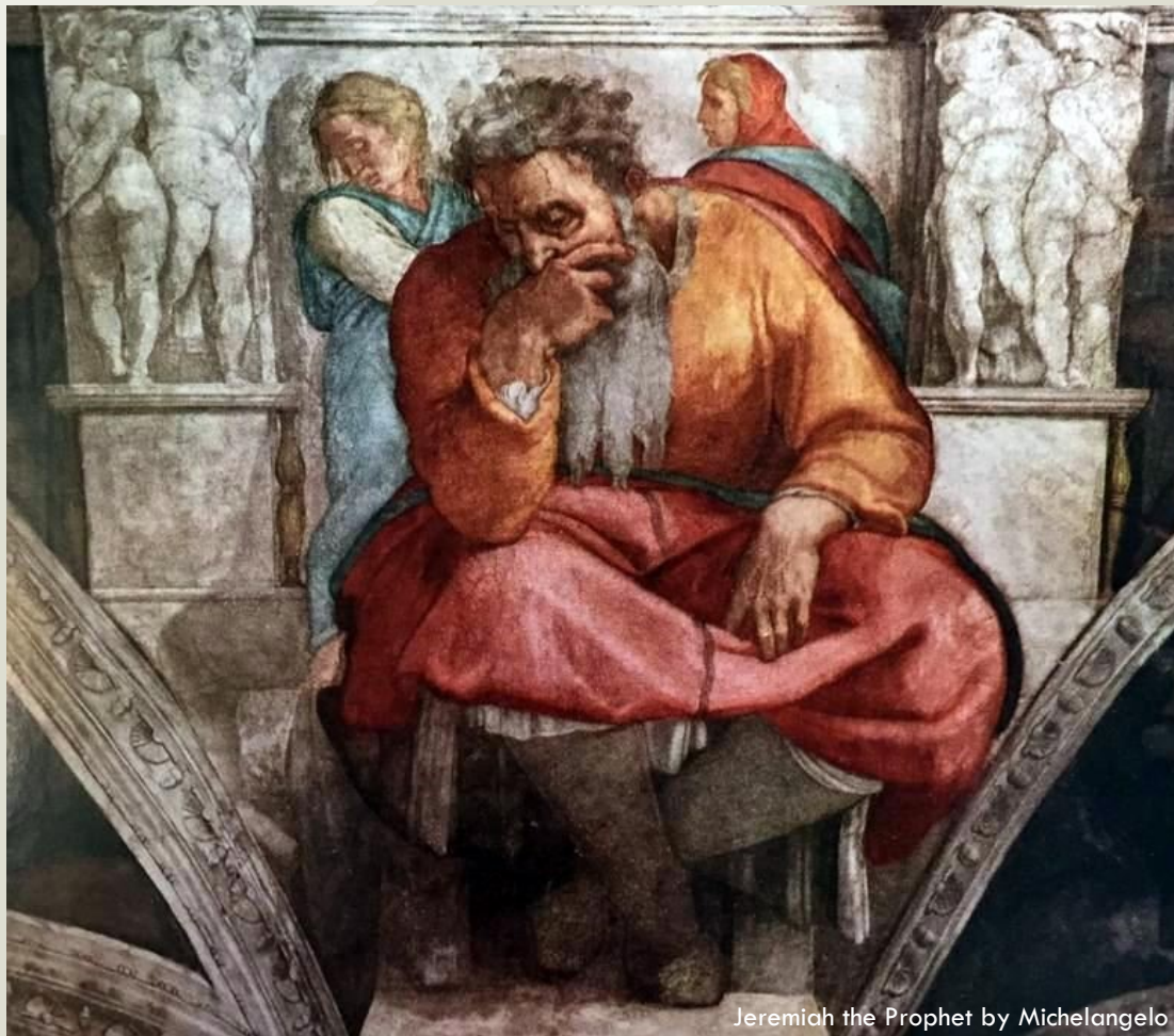
Jeremiah the Prophet by Michelangelo