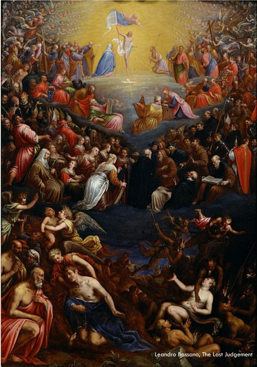
Leandro Bassano, The Last Judgement