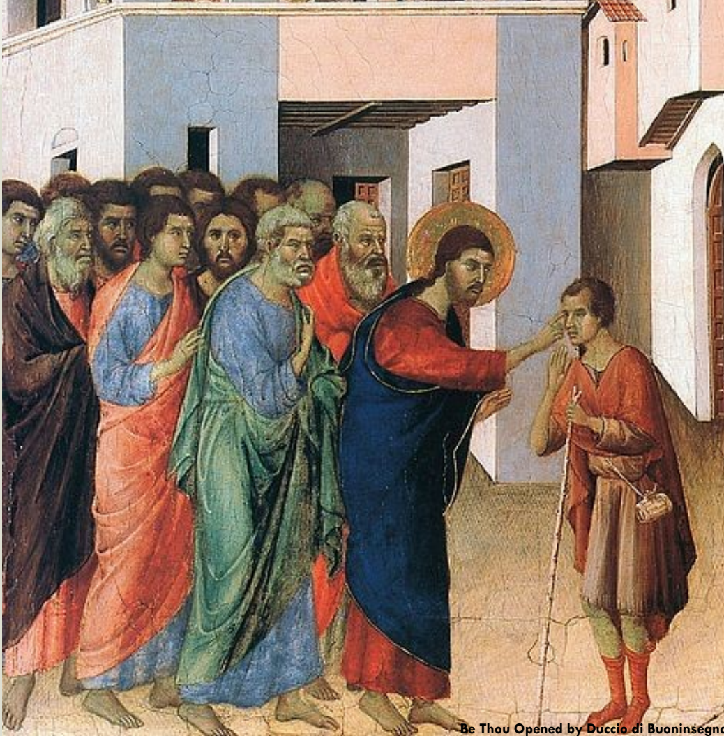
Be Thou Opened by Duccio di Buoninsegna