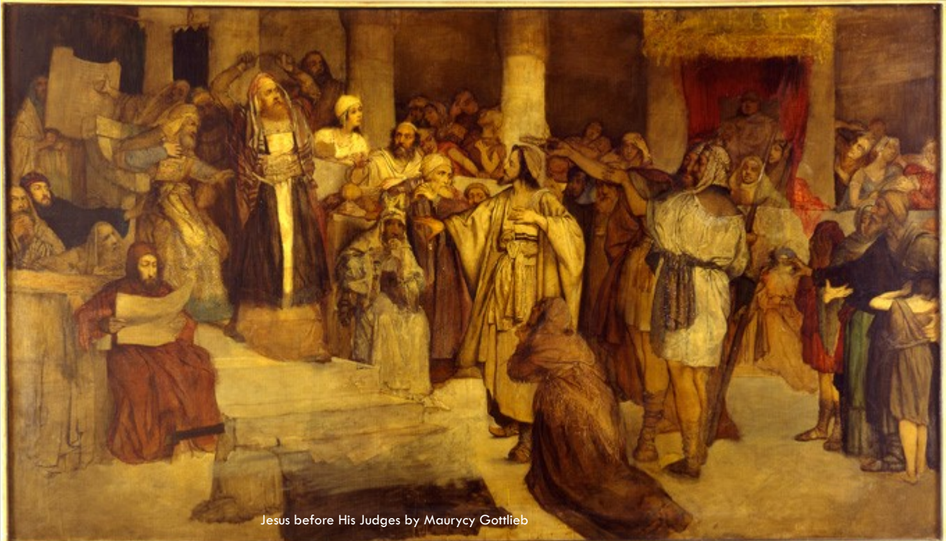
Jesus before His Judges by Maurycy Gottlieb