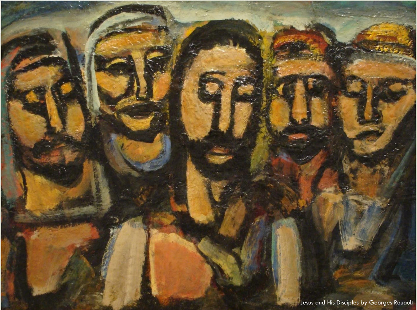
Jesus and His Disciples by Georges Rouault