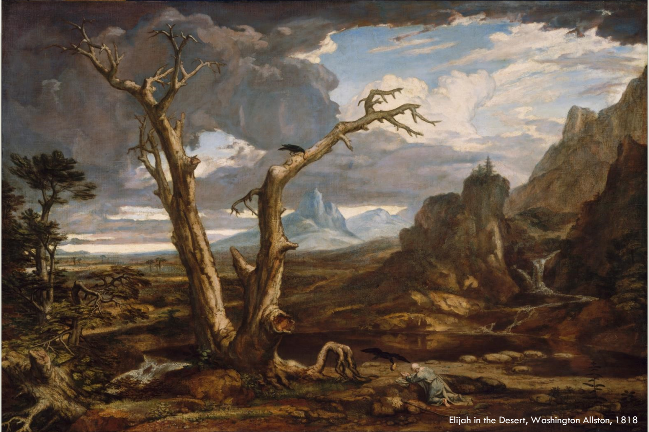
Elijah in the Desert, Washington Allston, 1818