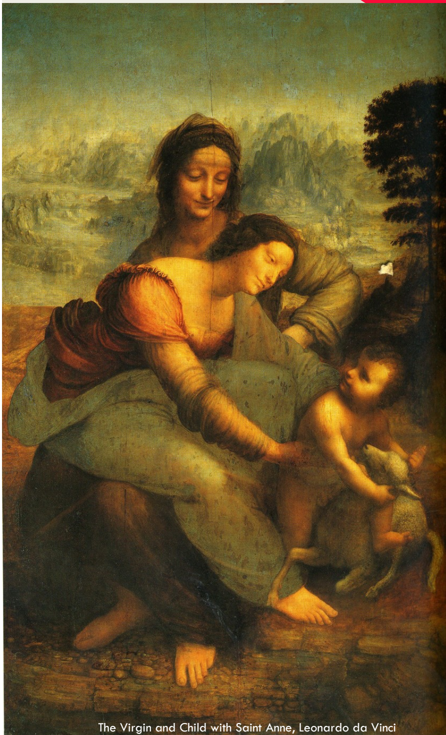
The Virgin and Child with Saint Anne, Leonardo da Vinci