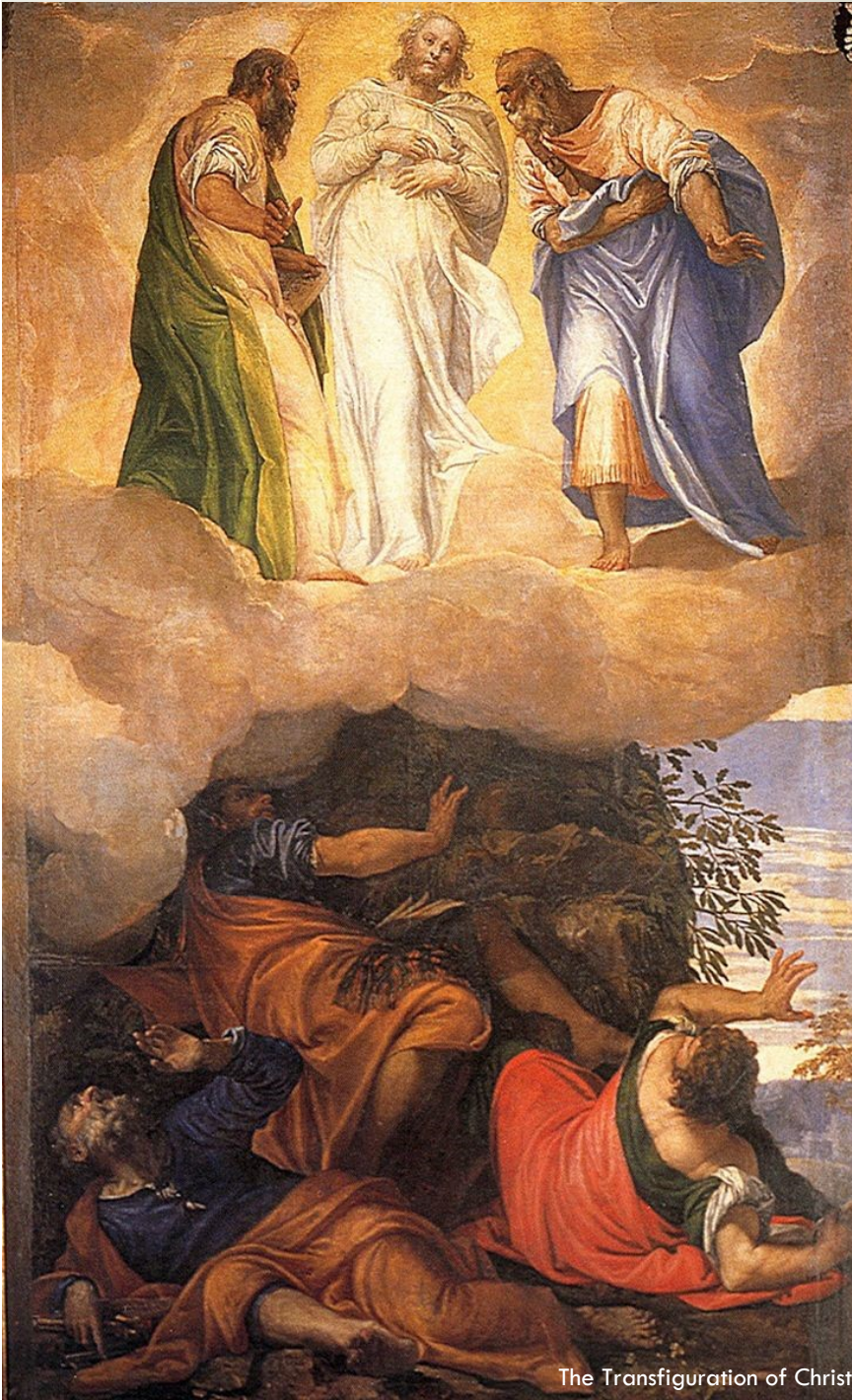
The Transfiguration of Christ