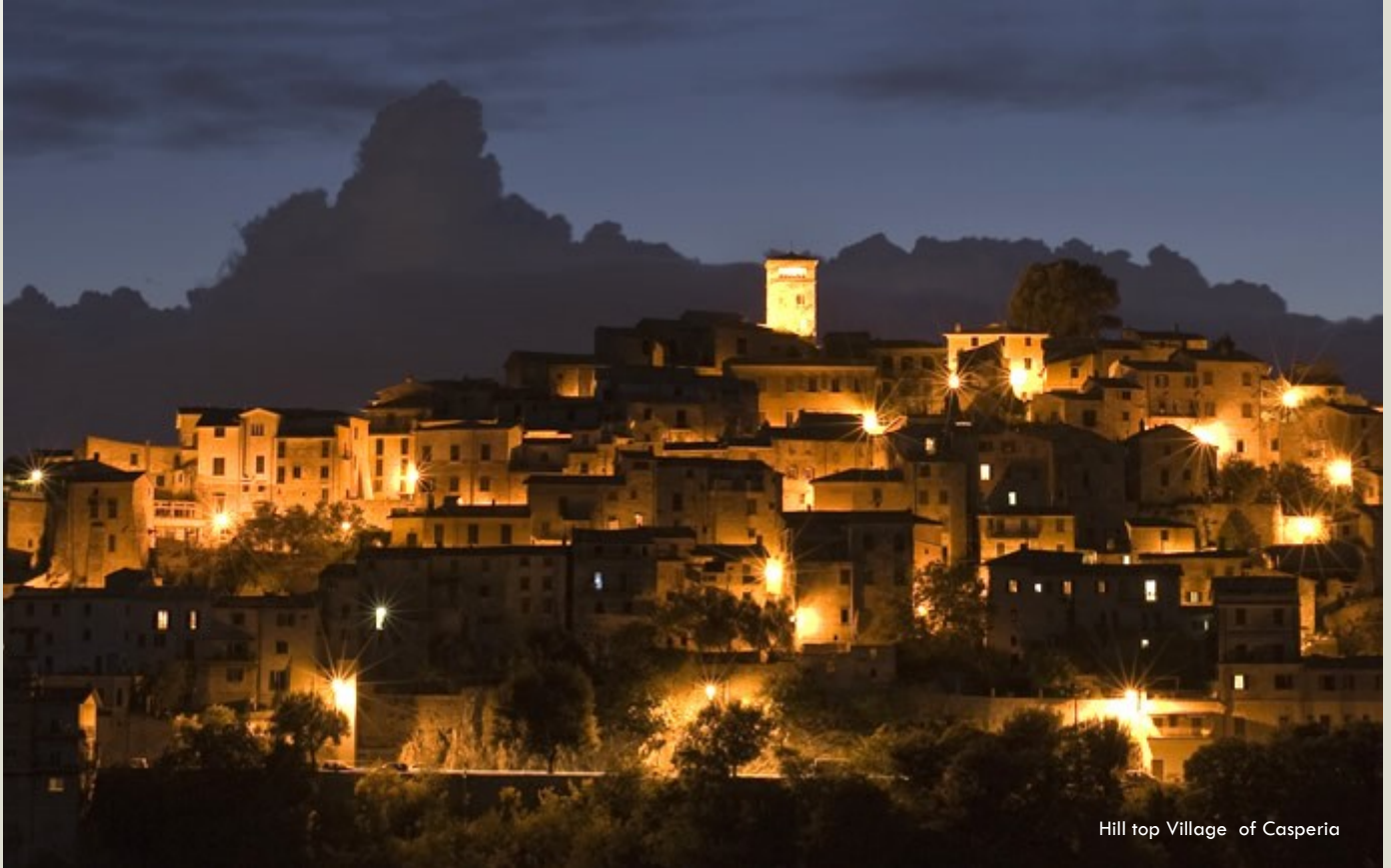
Hill top Village of Casperia