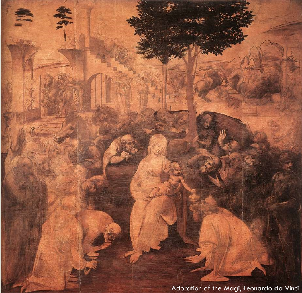
Adoration of the Magi, Leonardo da Vinci