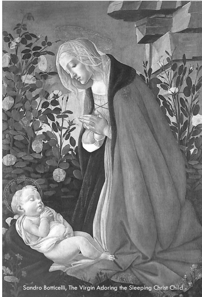
Sandro Botticelli, The Virgin Adoring the Sleeping Christ Child

Nowadays I am more focused on what I give to those I love, than in what I get. When I see what strikes me as just the right gift, I buy it and then set it aside until I can give it at Christmas. I sometimes buy a thing in the April or May savoring how much I am certain it will delight. The problem is that in a weak moment, I sometimes just give the gift right away; why should the poor guy have to wait until Christmas when he can be enjoying it right now? The other problem is that I hide a gift away in a closet and then forget I have it purchased already. There's probably a "Remember my Presents" app to help me keep track.