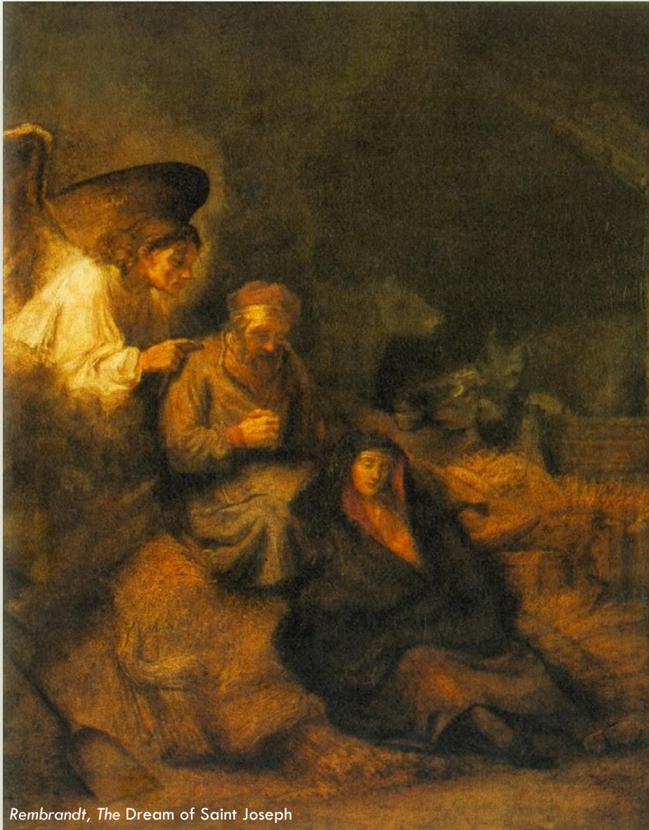
Rembrandt, The Dream of Saint Joseph