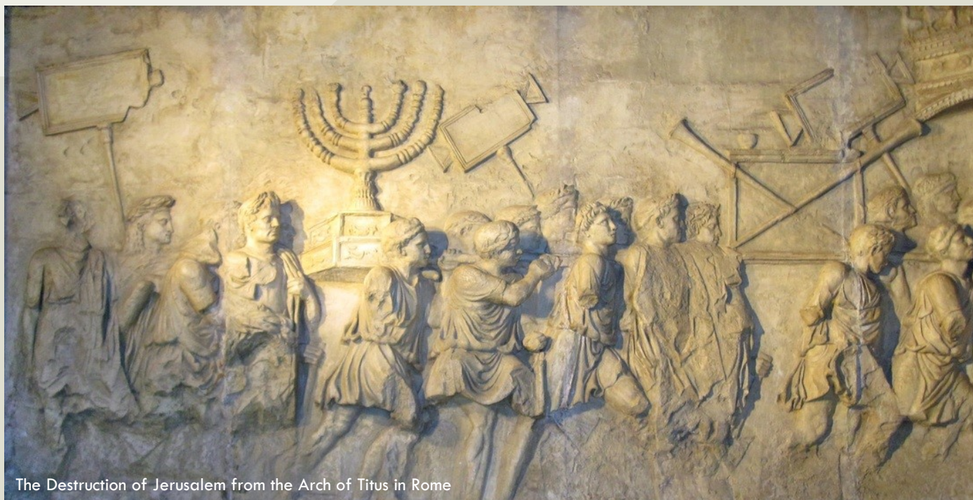
The Destruction of Jerusalem from the Arch of Titus in Rome