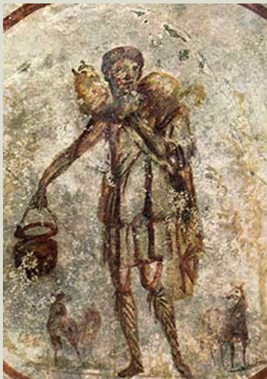
The Good Shepherd, Catacombs of St. Callixtus in Rome