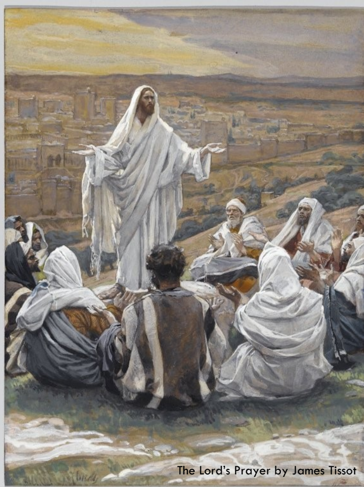
The Lord's Prayer by James Tissot