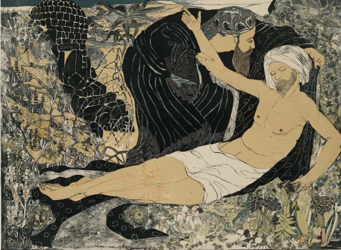
The Good Samaritan by Carel Adolf Lion Cachet