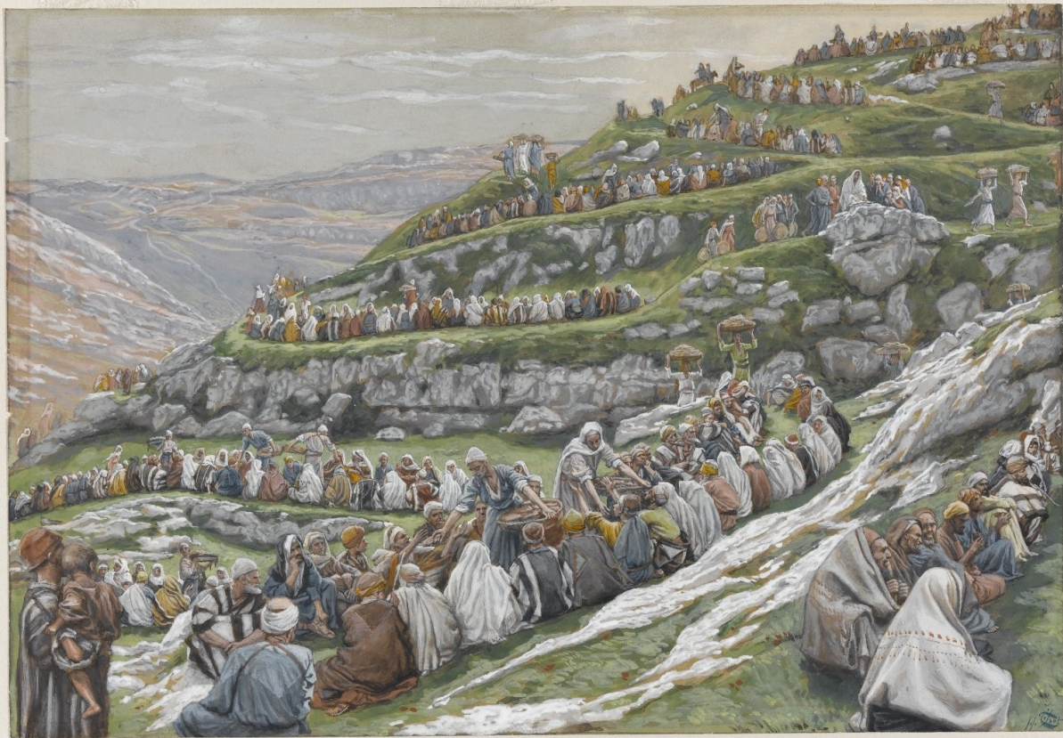
The Miracle of the Loaves and Fishes by James Tissot