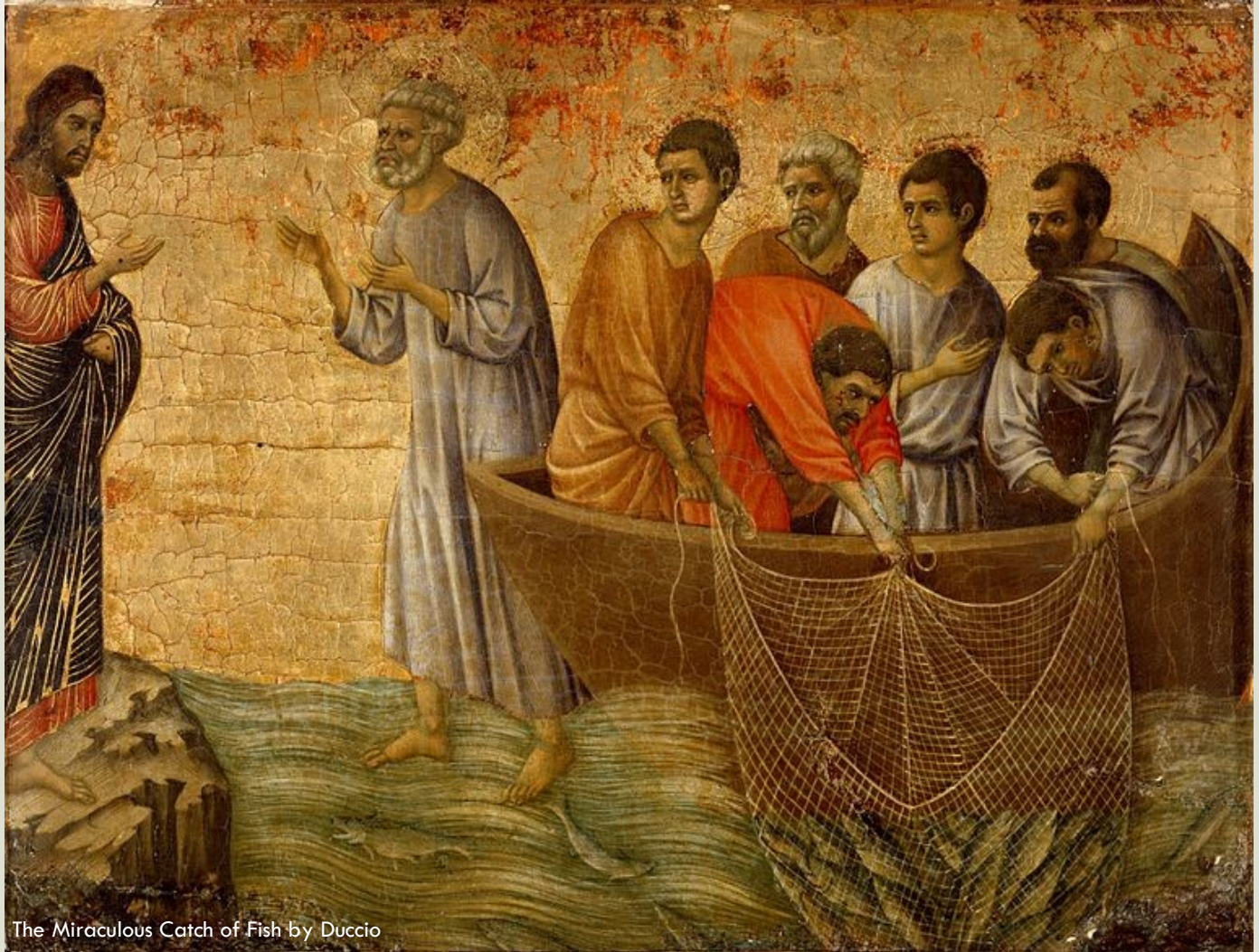
The Miraculous Catch of Fish by Duccio