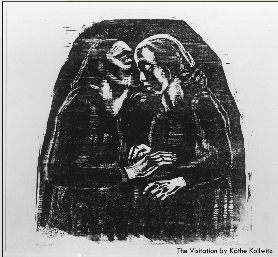
The Visitation by Käthe Kollwitz