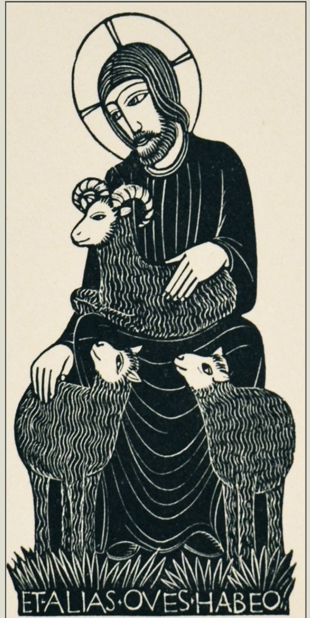
The Good Shepherd by Eric Gill