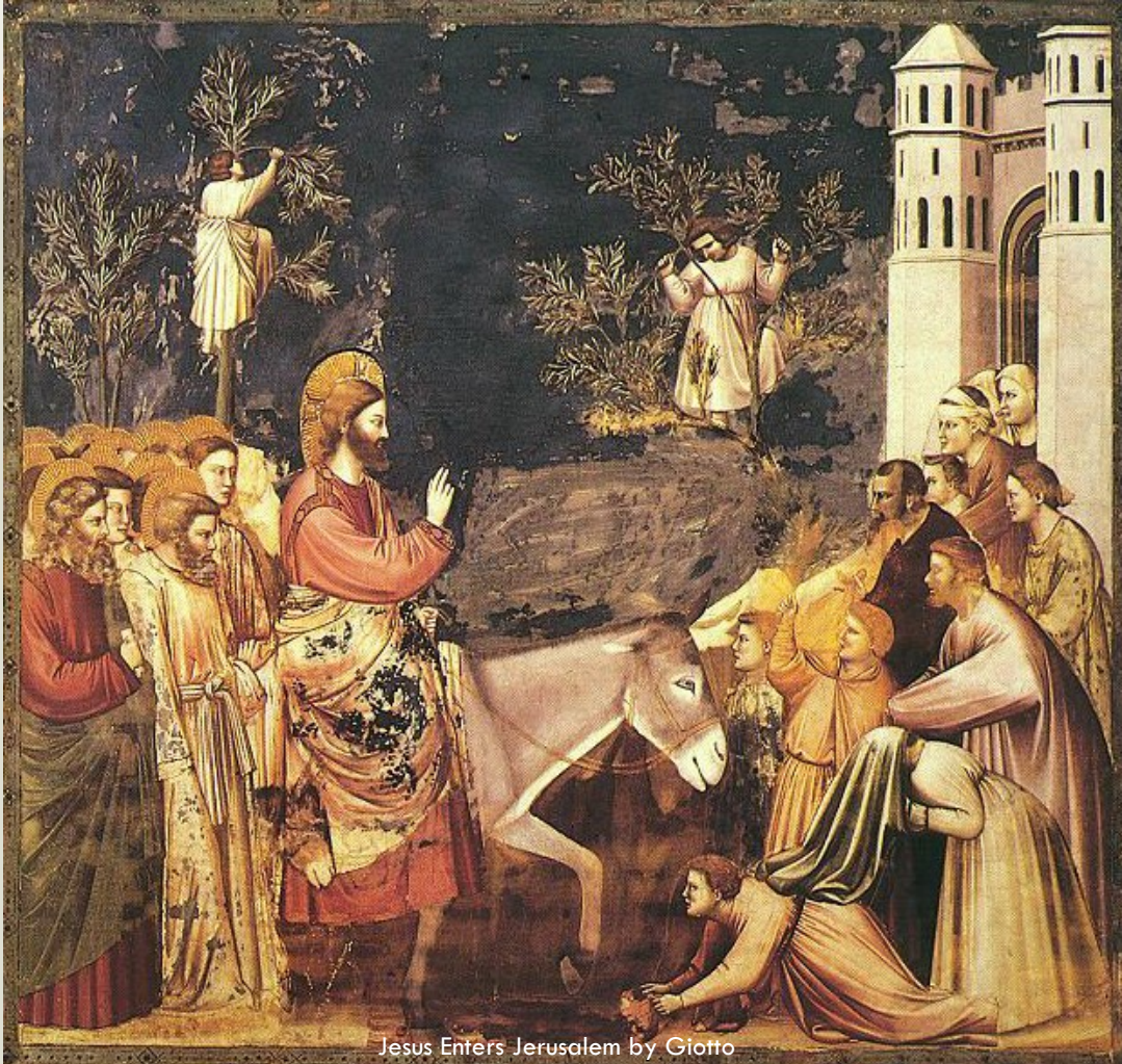
Jesus Enters Jerusalem by Giotto