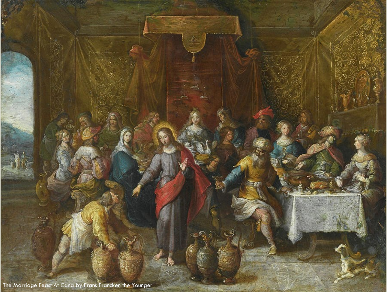
The Marriage Feast At Cana by Frans Francken the Younger