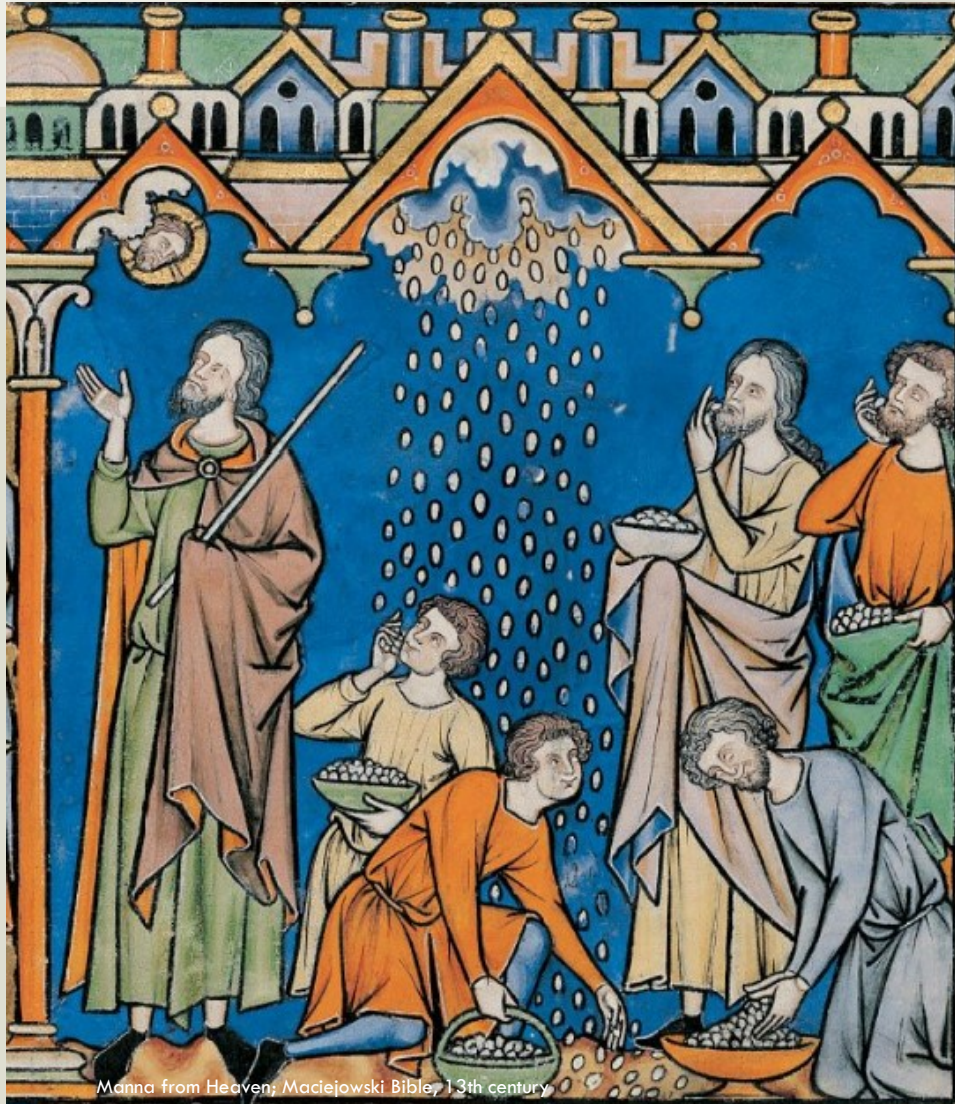
Manna from Heaven, Maciejowski Bible, 13th century