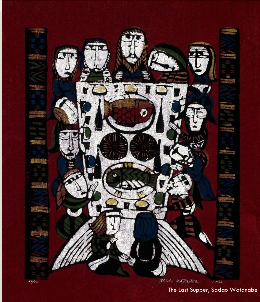
The Last Supper, Sadao Watanabe