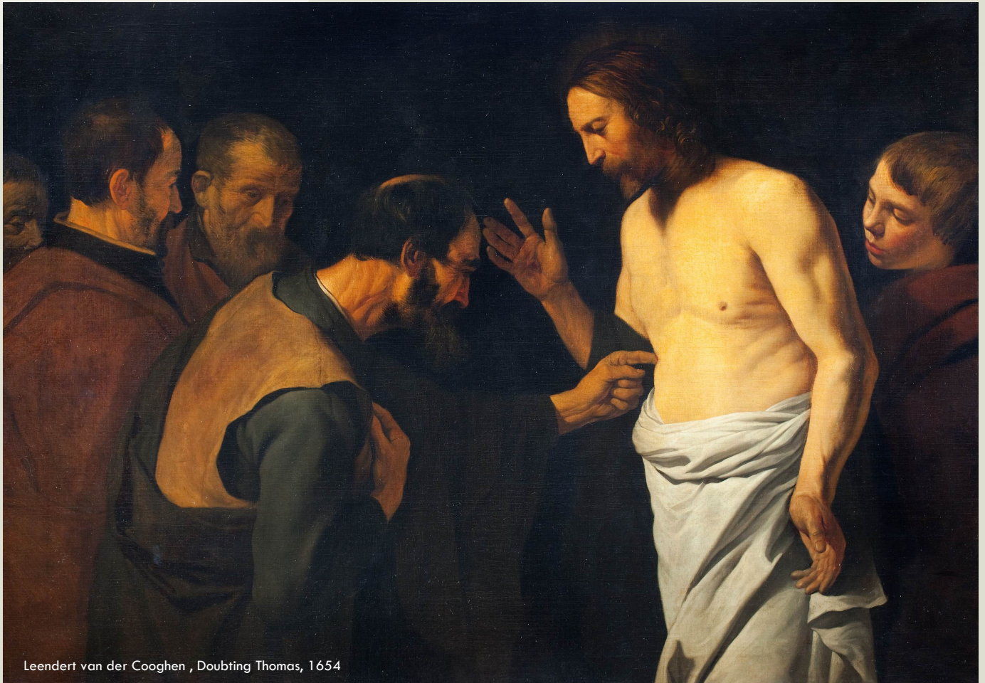
Leendert van der Cooghen , Doubting Thomas, 1654