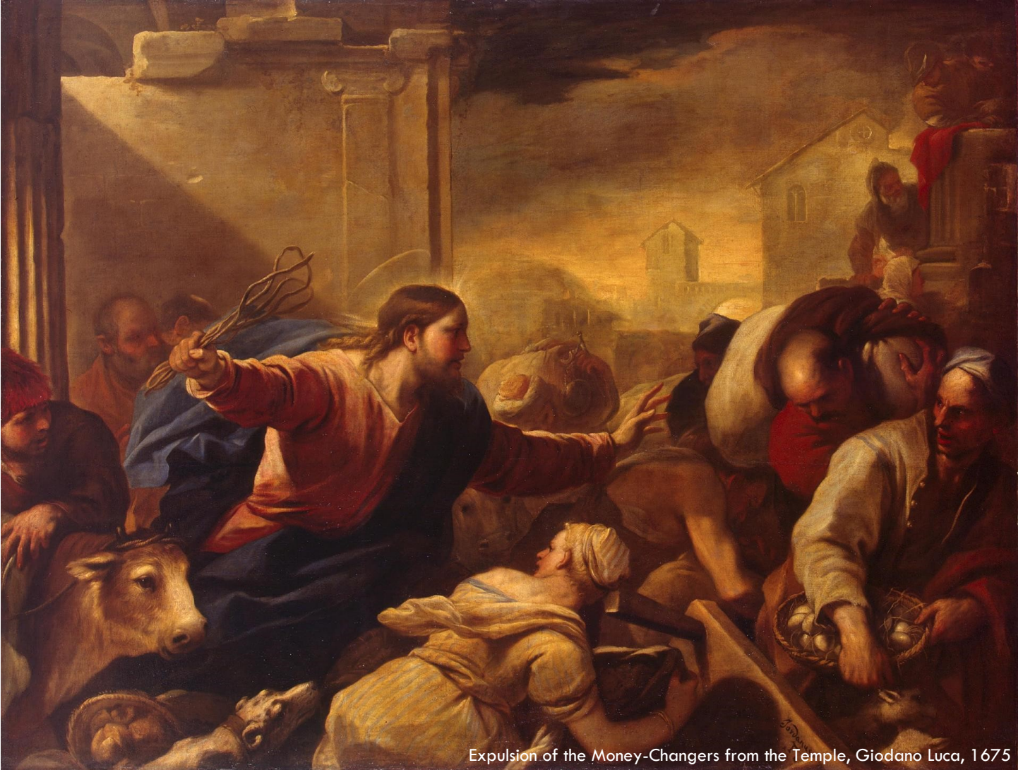
Expulsion of the Money-Changers from the Temple, Giodano Luca, 1675