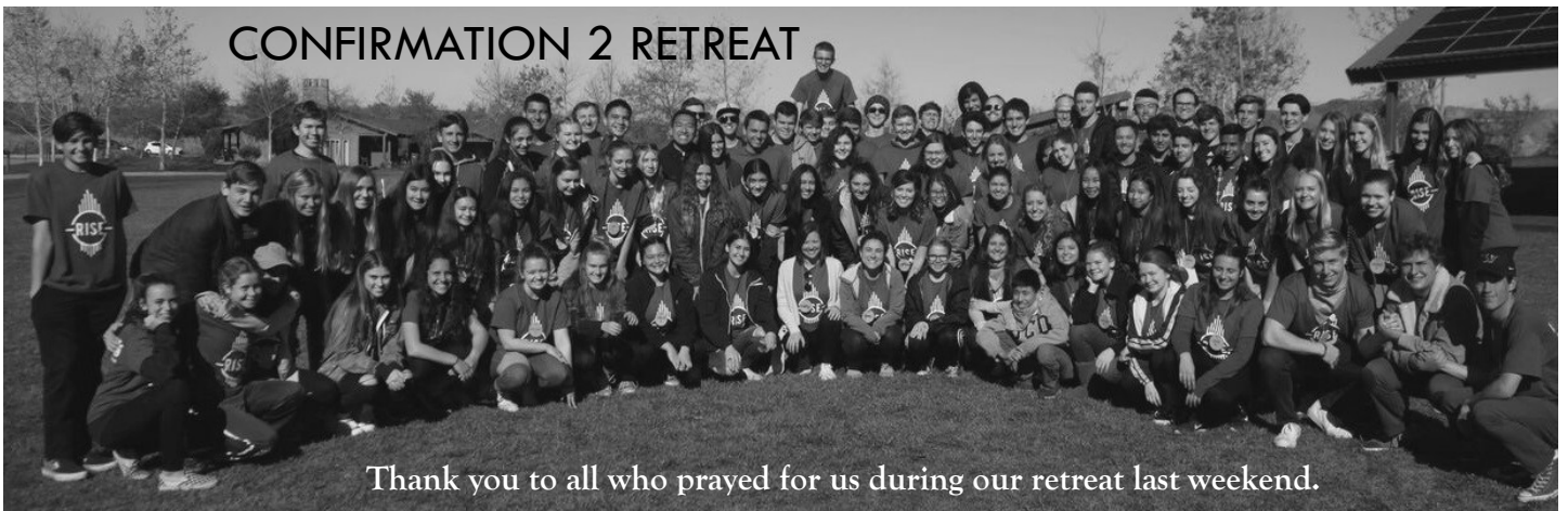
Thank you to all who prayed for us during our retreat last weekend.