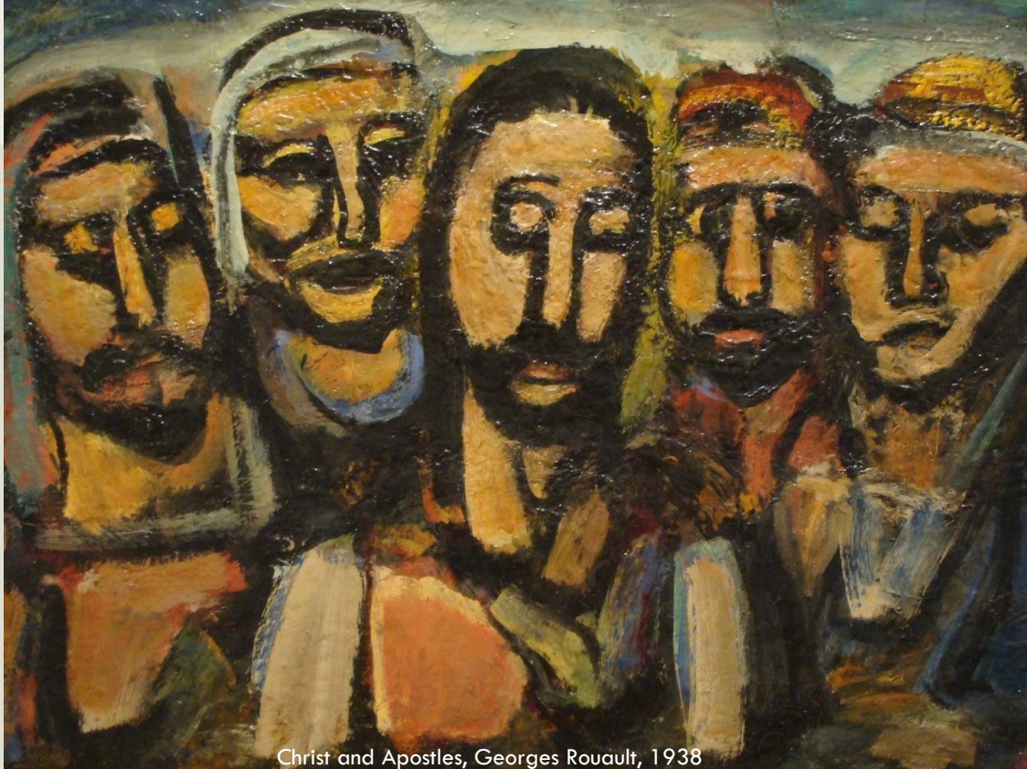
Christ and Apostles, Georges Rouault, 1938