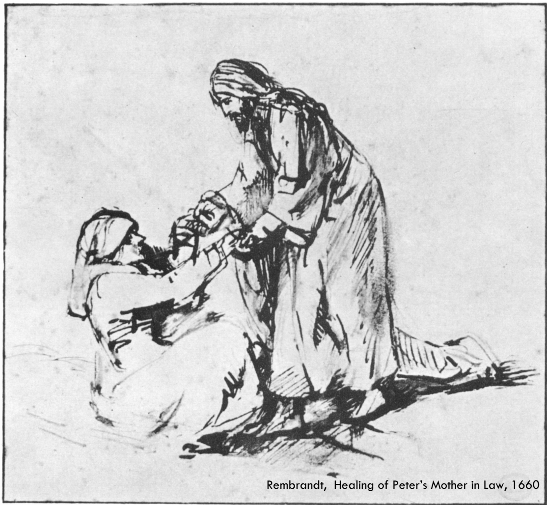
Rembrandt, Healing of Peter's Mother in Law, 1660