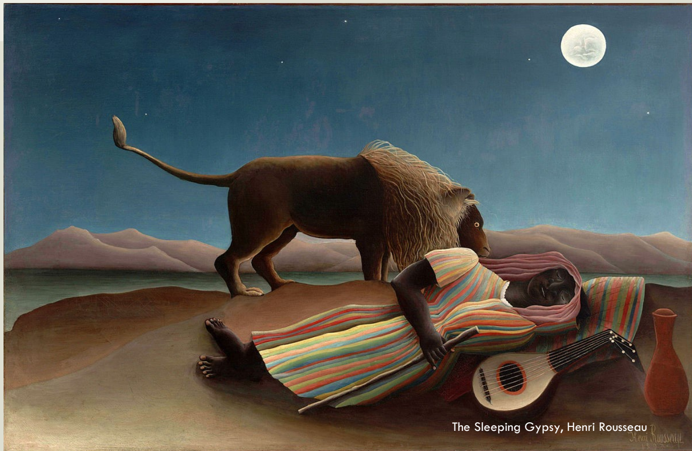
The Sleeping Gypsy, Henri Rousseau

MASSES: SAT: 5:00 PM; SUN: 8:00, 10:00 AM; 12:00, 4:00 PM DAILY: 9:00 AM