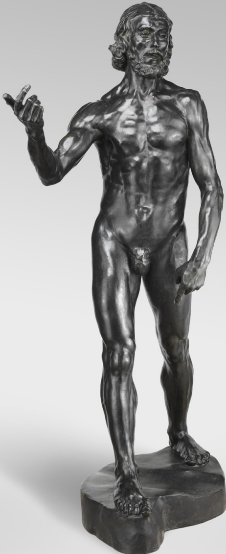
John the Baptist Preaching, Auguste Rodin, 1925