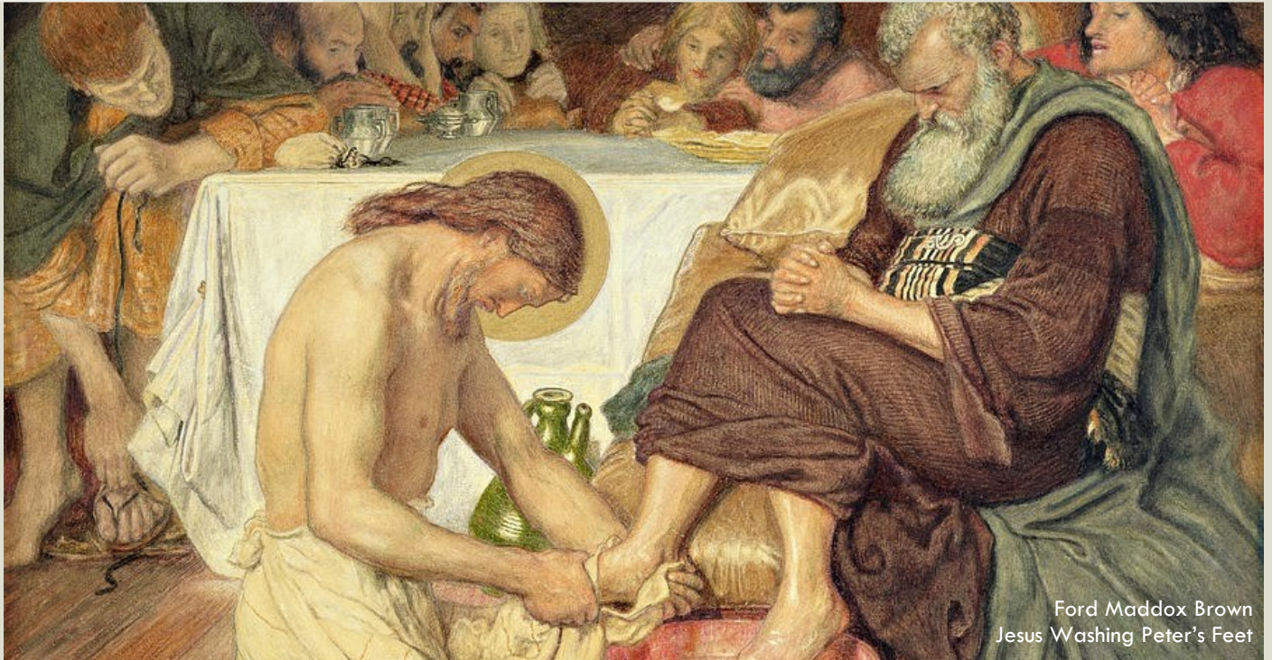
Ford Maddox Brown Jesus Washing Peter's Feet

MASSSES: SAT: 5:00 PM; SUN: 8:00, 10:00 AM, 12:00, 4:00 PM DAILY: 9:00 AM