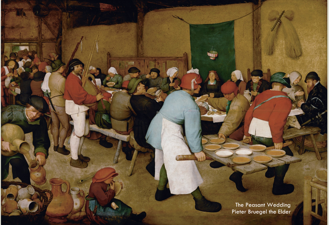
The Peasant Wedding Pieter Bruegel the Elder

MASSES: SAT: 5:00 PM; SUN: 8:00, 10:00 AM, 12:00, 4:00 PM; DAILY: 9:00 AM CONFESSIONS: Mon-Sat: 8:30 AM; Sat: 4:00-4:45 PM